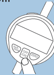
① Dial indicator